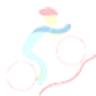
CYCLING MOUNTAIN BIKE