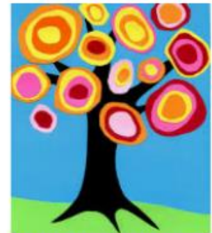
Use brightly coloured papers