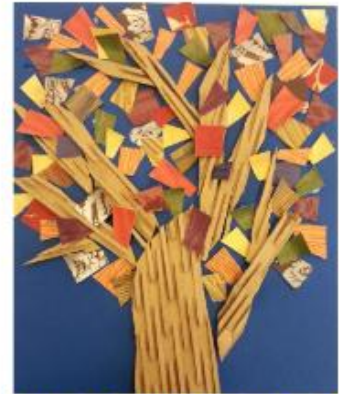
Use recycling materials