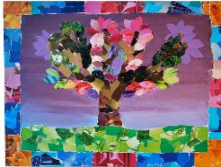
Use magazine pages and paint