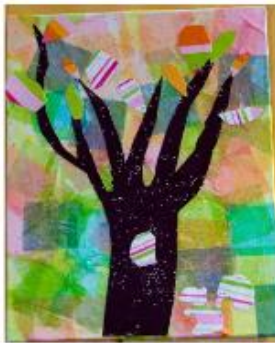
Use tissue paper and silhouettes

Make your own Tree of Hope collage using one of these ideas or any other way you fancy!