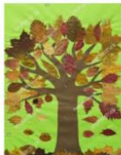
Use real leaves